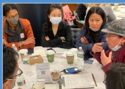
Attendees discuss questions about casino marketing at their tables.