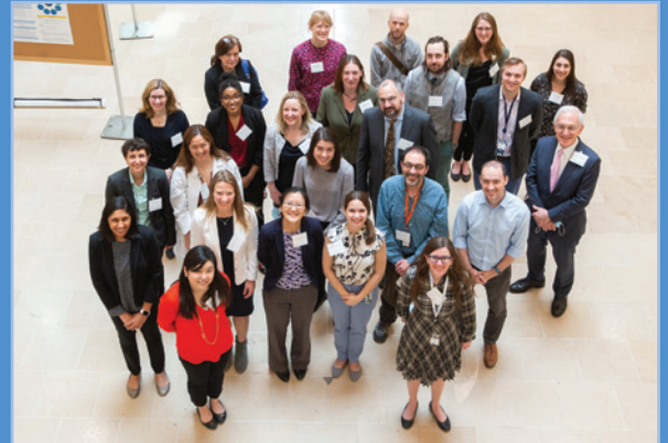
The poster session was a great opportunity to get a group shot of our students, faculty, staff, and leadership!